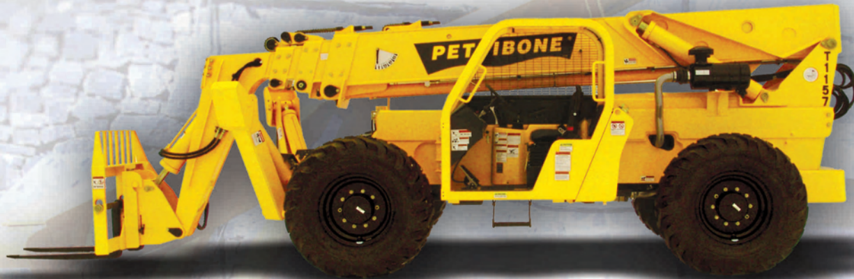
STANDARD FORK FRAME REACH