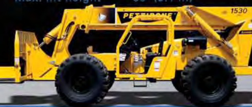
enlarged image of 1530 on back

Standard Fork Frame -31,520 lbs (14,298 kg) Baler -32,000 lbs (14,515 kg)